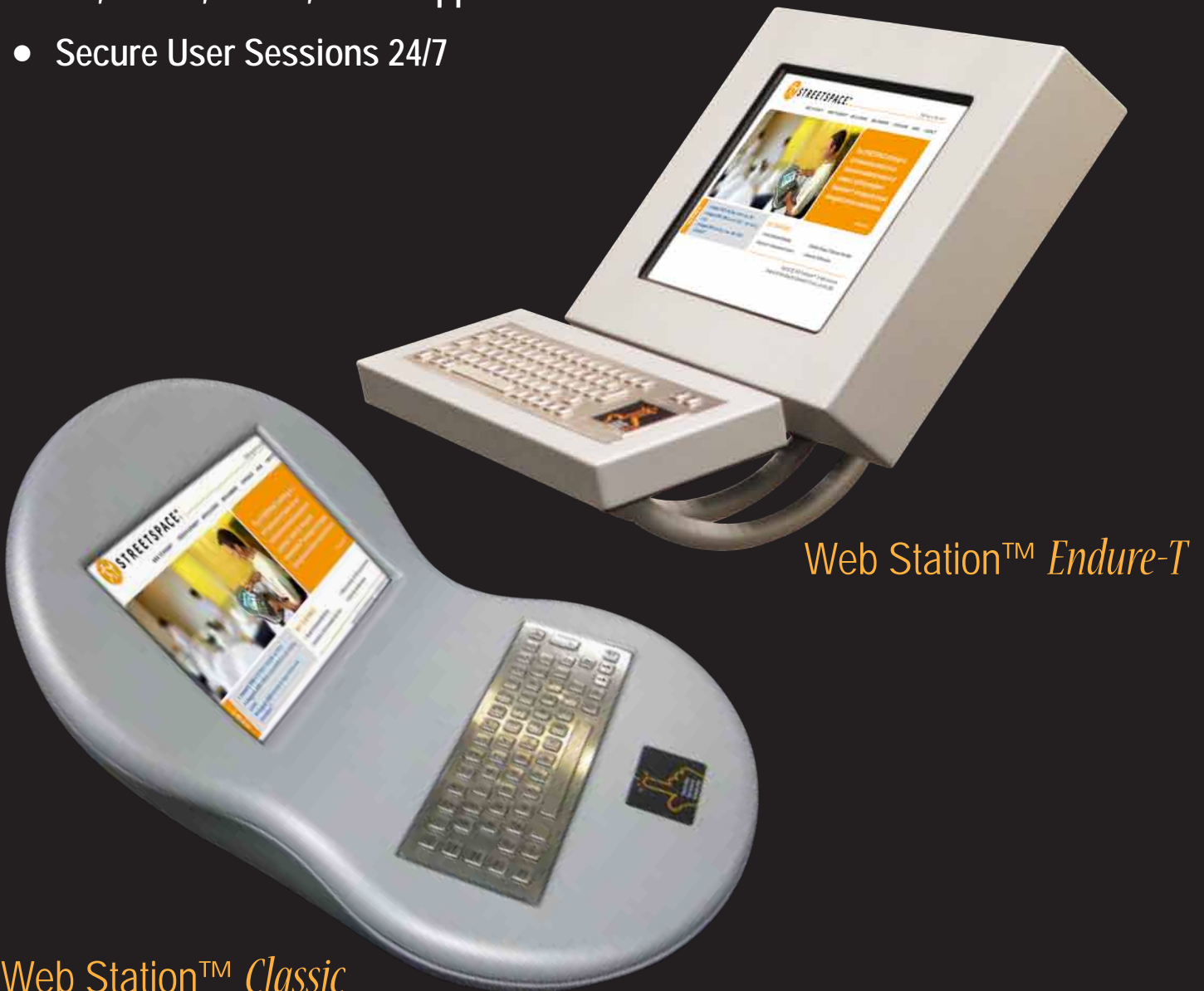
Web Station™ Endure-T